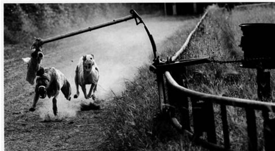
Category C-5: Photo Package First Place: Dan Kramer, Houston Press , "Greyhound Racing"

Comments: Downing just doesn't back down getting the low-down on this outrageous betrayal of the community that needs all the help it can get.